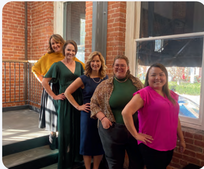
your LOCAL United Way team